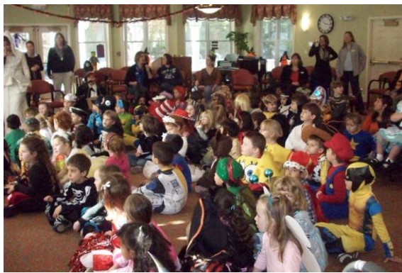
The Very Scary Hemenway School Kindergarteners at Heritage