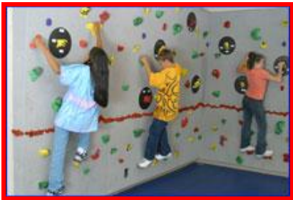
Hemenway's Climbing Wall