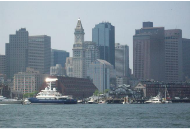
Boston Harbor Cruise